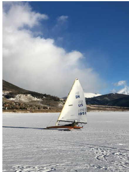
If you can't reach Phil or Craig, look for them here