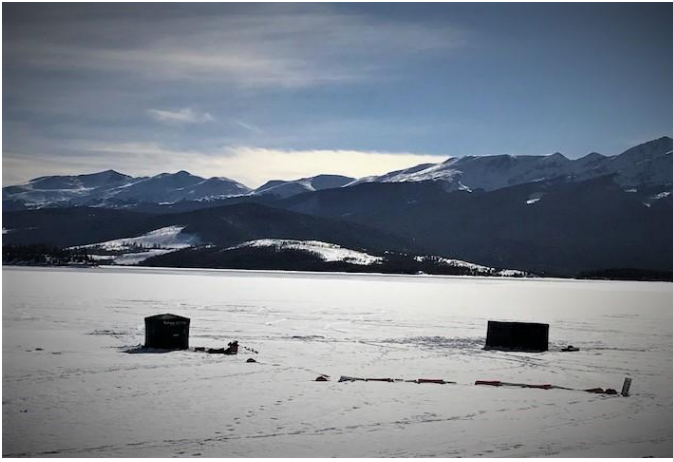
A whole new reservoir sport