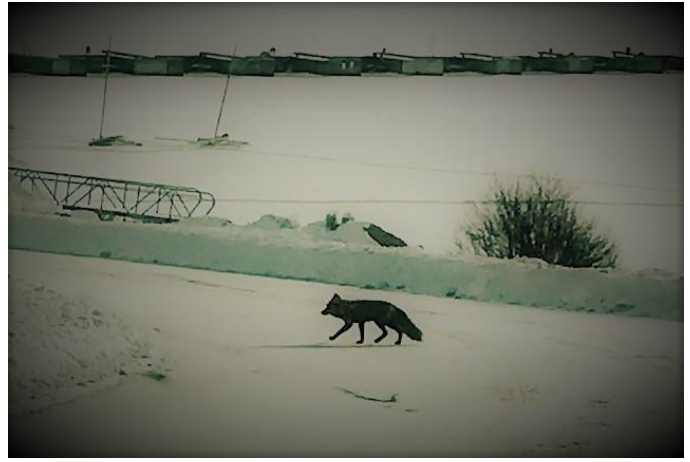
Our regulars in the winter