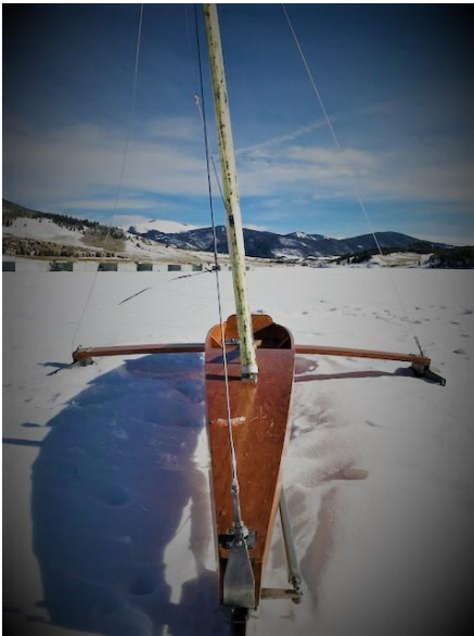
A closer look at winter sailing